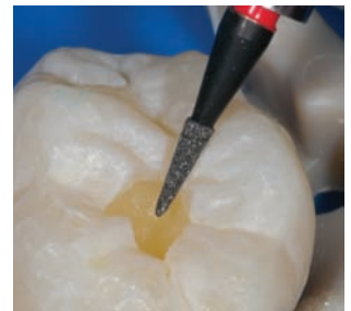
Margin bevelling and finishing of occlusal cavities