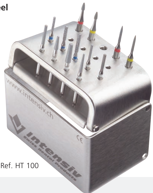
Ref. HT 100