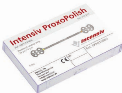
Pack of 6 strips Ref. PXPO1508/6