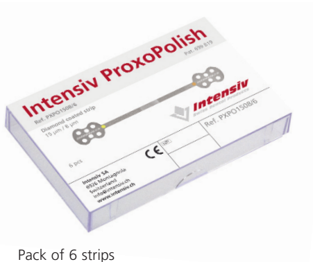
Pack of 6 strips Ref. PXPO1508/6